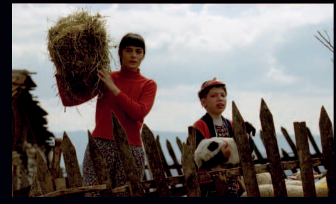
THE WOMAN WHO BRUSHED OFF HER TEARS 35 mm, CinemaScope, Color, Dolby Digital SR-D, 103'